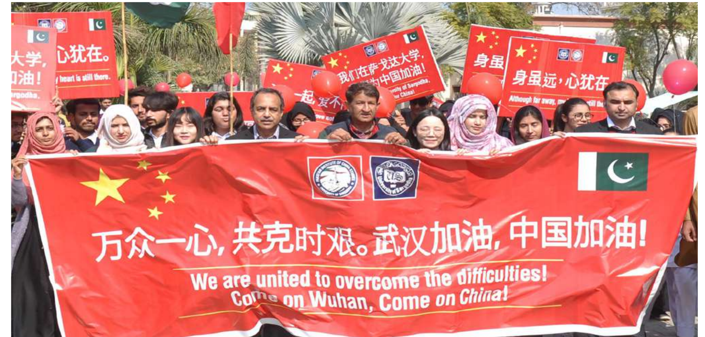
The participants of the walk – carrying banners and play cards inscribed with "We are united" – were chanting slogans to show their support to Chinese people coping with novel coronavirus

The students and faculty members of Sargodha University, along with the Chinese language teachers, actively participated in a walk and produced video messages to express solidarity with China in its struggle against coronavirus. The walk was arranged by the Pakistan Institute of China Studies (PICS) on February 13, when the pandemic was still largely confined to China. The efforts made by Sargodha University received