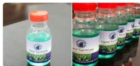
4:09 PM - Mar 21, 2020 - Twitter for iPhone

Deputy Commissioner Sargodha College of Pharmacy at @UOS.edu has produced Hand Sanitizers with Aloe vera & Lavender oil which not only meets the standard health requirements but is also cost effective valuing at less than Rs. 100.