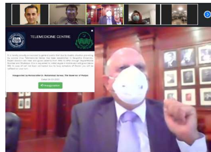
Governor Punjab inaugurates Telemedicine centre through video link

categories including Surgery, Medicine, Paediatrics, others and primarily Corona as the major category will render their services.