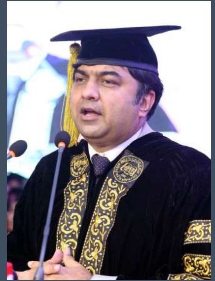
Raja Yassir Humayun Sarfaraz

Higher Education Minister Government of Punjab