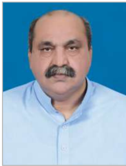
پروفیسر مبارک بٹ، صدر پنجاب لوک اہر