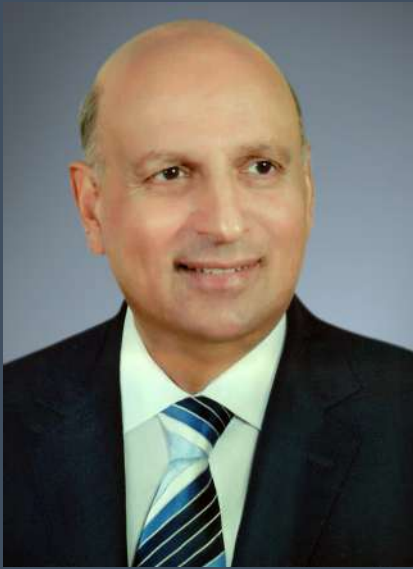
Chaudhry Mohammad Sarwar Governor Punjab

The University of Sargodha has earned its name as a major public sector institute in a short span of time through research and innovation. I hope that the graduates of today have made optimal use of the opportunities offered by infrastructure and academic facilities of the University to have their skills-set for coping with challenging careers ahead.