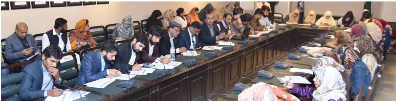
Visiting faculty members attending the workshop

S argodha University, in collaboration with Higher Education Commission (HEC), organized one-day training program for the visiting faculty of all disciplines for their capacity building that will, in the end, improve the quality of education being imparted to the students.