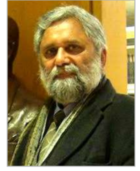
پروفیسر پریتھم سنگھ، آکسفورڈ یونیورسٹی، برطانیہ