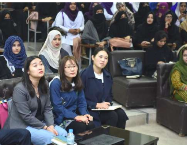
Chinese language teachers and students in the audience

The lecture dispelled some of the misconceptions about China Pakistan Economic Corridor and China's intentions to colonize Pakistan, which have been portrayed negatively by Western media.