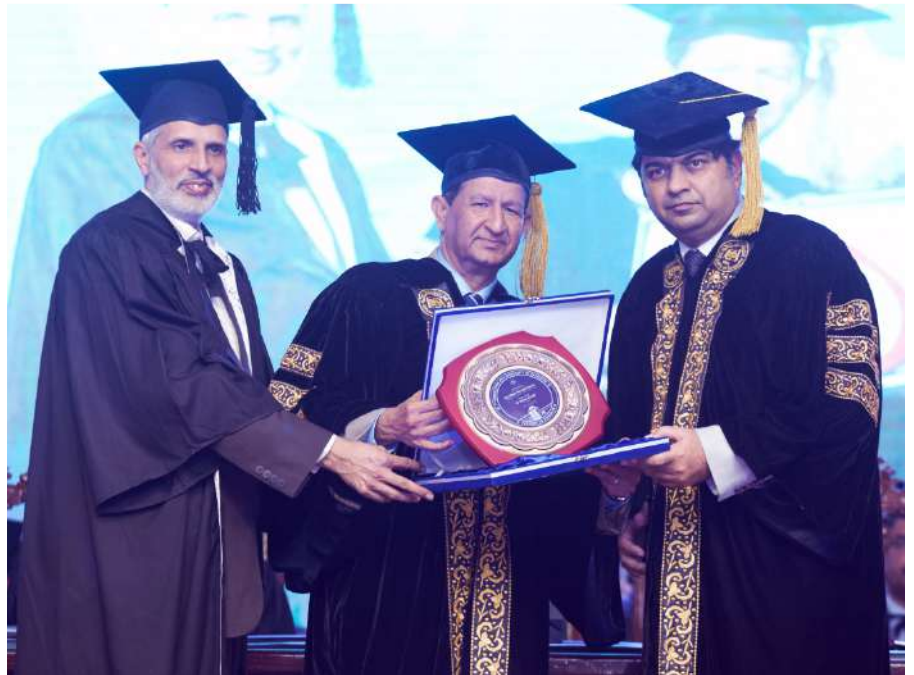
The Pro-Chancellor being presented shield by the Vice Chancellor

I am hopeful that the University will move towards academic excellence and will become a role model for other