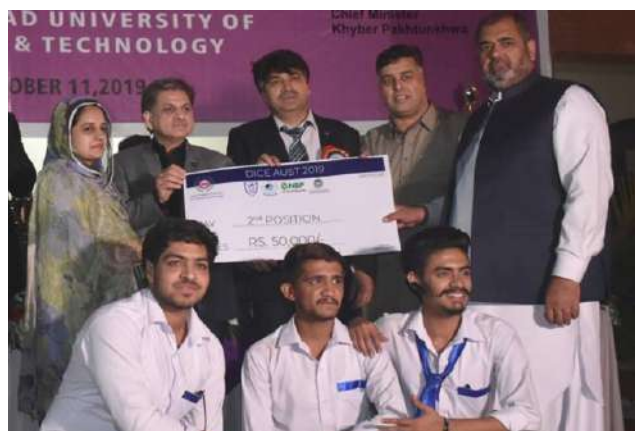
The project team poses for group photo with cash prize