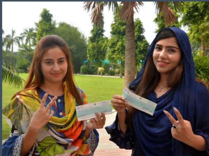
DPT students from ex-PPP sub-campuses cheering after receiving the cheques

Speaking on the occasion, Director NAB Lahore pointed out that the main charge, in this case, was cheating public at large as the respondents misused authority for personal interests; illegally established two PPP sub-campuses; made excess admissions in unapproved programs; overcharged fee from students; issued forged documents to students; made illegal appointments; awarded tenders to the favourite bidders; and deducted the amount of fine imposed on a contractor for delaying the