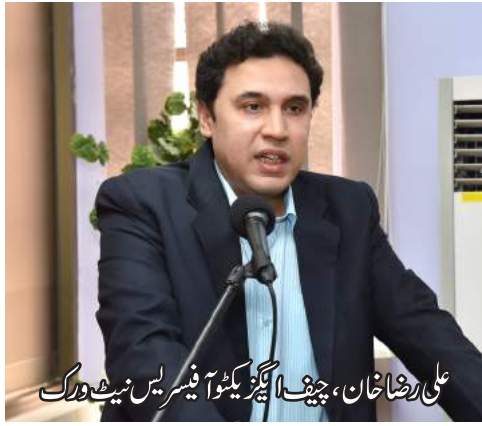
علی رضا خان، چیف جسٹس آف سندھ

معاشرے اپنے لوگوں کو ساتھ لے کر چلتے ہیں نہ کہ انہیں الگ رکھتے ہیں۔ انھوں نے کہا کہ اعلیٰ تعلیمی اداروں میں یہ خاصیت ہوتی ہے کہ وہ عوام کو حقیقی تبدیلی